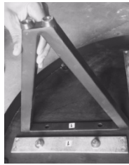
Match the Number of Metal Legs