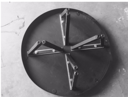
Fix ALL 4 Legs