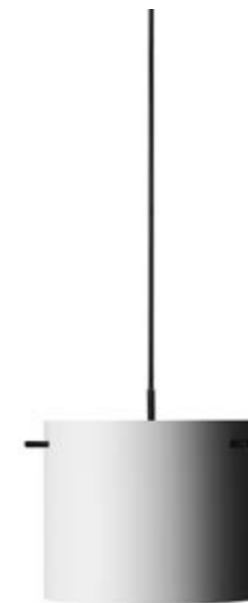
\varnothing 28 cm: matt black: art.no. 109310 \varnothing 28 cm: matt white: art.no. 109312