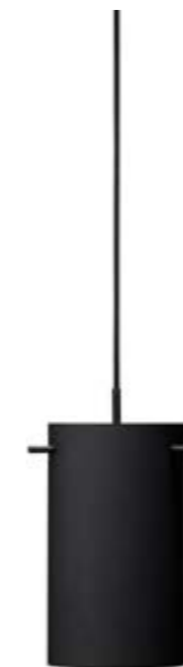
\varnothing 16 cm: matt black: art.no. 109318 \varnothing 16 cm: matt white: art.no. 109320