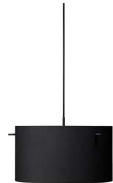
\varnothing 41 cm: matt black: art.no. 109302 \varnothing 41 cm: matt white: art.no. 109304