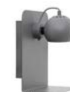
Matt grey. Art.no. 104537