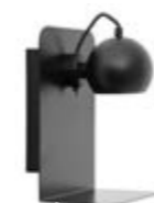
Matt black. Art.no. 104530