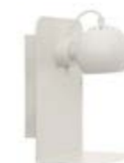
Matt white. Art.no. 104534