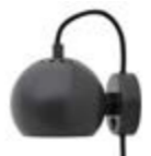
Matt dark grey. Art.no. 104740