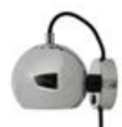
Glossy chrome. Art.no. 104784