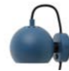
Matt petrol blue. Art.no. 104739