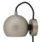
Matt brushed satin. Art.no. 104751