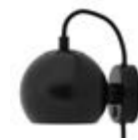
Matt black. Art.no. 104755