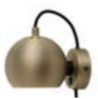
Matt antique brass. Art.no. 104741