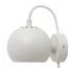
Matt white. Art.no. 104756