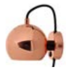
Glossy copper. Art.no. 104744