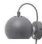
Matt light grey. Art.no. 104776