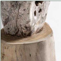
Figure measurement (cm.): 23X20X30.

Base / legs measurement (cm.): 20X20X17.