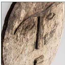
Figure measurement (cm.): 28X4X56.